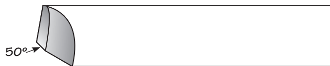
1/2" Bowl Gouge

To finish off our bowl we need a deep fluted gouge. The Hamlet 2030 1/2" gouge with a 50 degree bevel (also shorted to 1/8" bevel like our detail tool) that will allow us to run the bevel (on most bowl projects) continuously throughout the curve of the interior of the bowl. Producing a very clean cut, this tool will eliminate the use of any scrapers on our work.